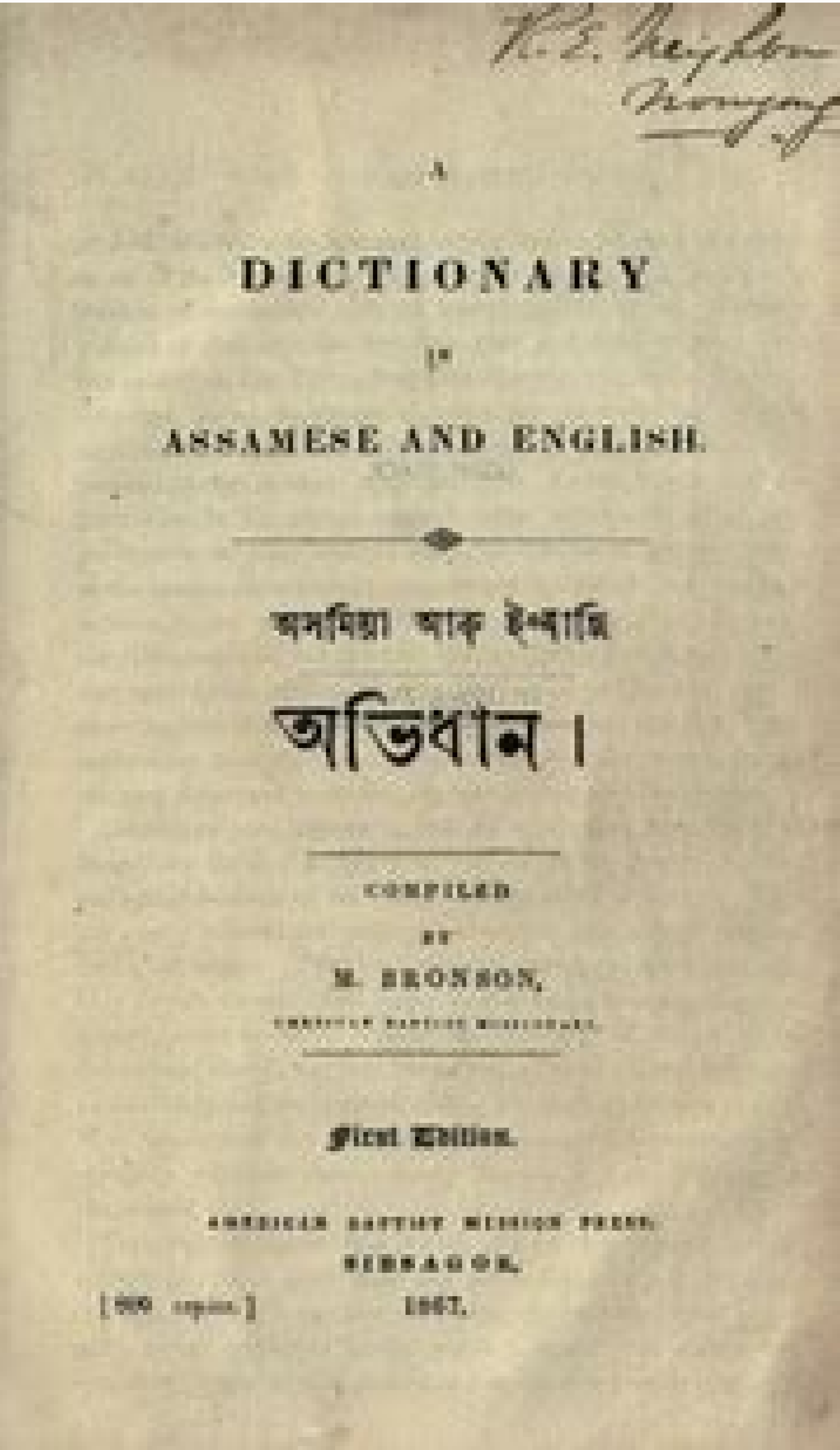
Assamese dictionary hemkosh free download.